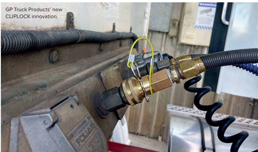
GP Truck Products’ new CLIPLOCK innovation.